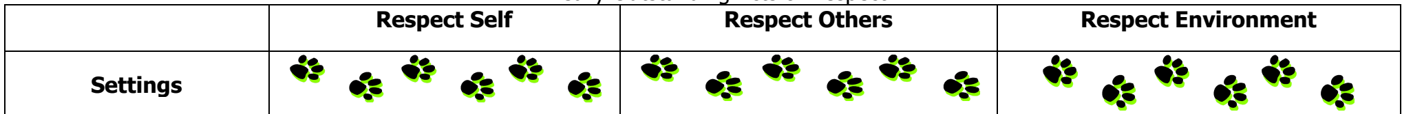
Washington Wildcats Behavior Matrix Really Outstanding Acts of Respect

Students are taught how to Respect Self, Others, and their Environment through the Behavior Matrix throughout the school year.